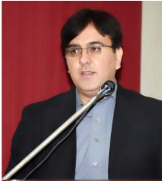
President PMDCs Alumni Association