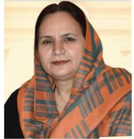
Patron PMDC Alumni Association

Over a long period of time, Peshawar Model Degree Colleges are producing students with colours, hence the respective institutions maintain a complete record of their growth and final absorption in variety of academics, health, industrial, information technology and administrative fields. In order to remain in touch with the Alumni, PMDCs Alumni Association has been established to follow up of outgoing brilliant students and organize annual get together.