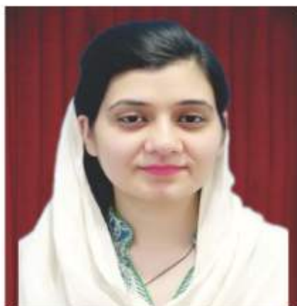
Member PMDC Alumni Association