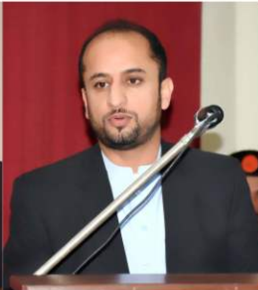
Vice President PMDCs Alumni Association