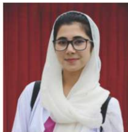
Member PMDC Alumni Association