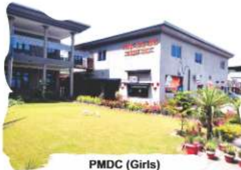
PMDC (Girls) Hayatabad, Peshawar