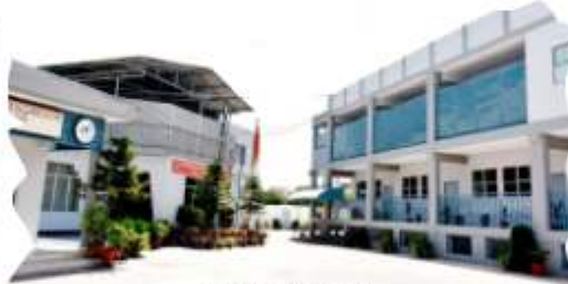
PMDC (Boys) Hayatabad, Peshawar