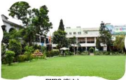
PMDC (Girls) Dalazak Road, Peshawar