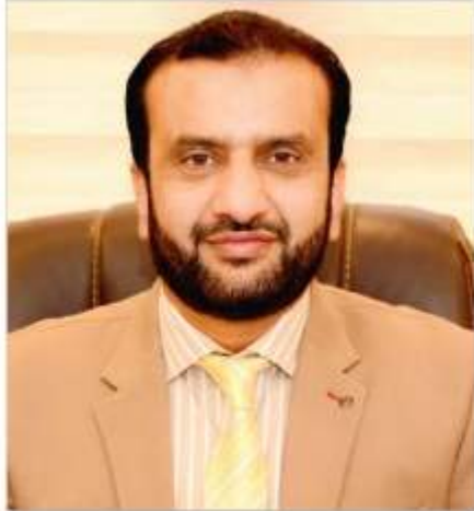
Patron in Chief PMDC Alumni Association

Over a long period of time, Peshawar Model Degree Colleges are producing students with colours, hence the respective institutions maintain a complete record of their growth and final absorption in variety of academics, health, industrial, information technology and administrative fields. In order to remain in touch with the Alumni, PMDCs Alumni Association has been established to follow up of outgoing brilliant students and organize annual get together.