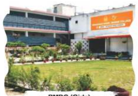
PMDC (Girls) Nowshera Road, Mardan