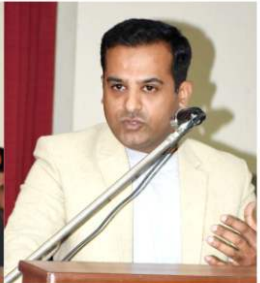
Coordinator PMDCs Alumni Association