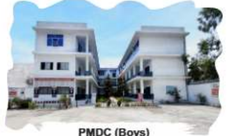
PMDC (Boys) Nowshera Road, Mardan