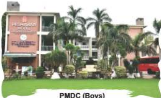
PMDC (Boys) Dalazak Road, Peshawar